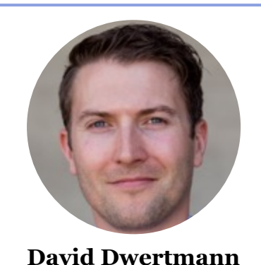
Rutgers School of Business Find out more