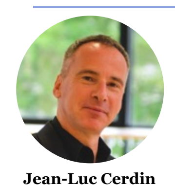
ESSEC Business School Find out more